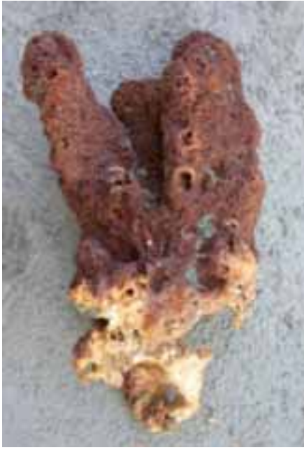
Figure 1. 26149