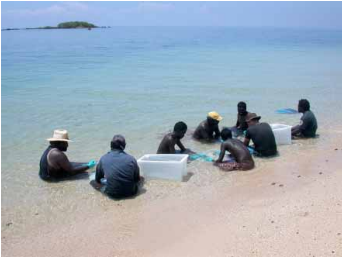
Figure 4. Maningrida Sea Rangers cutting the harvested sponges and threading the explants onto lines. Gloves are worn to prevent contamination.