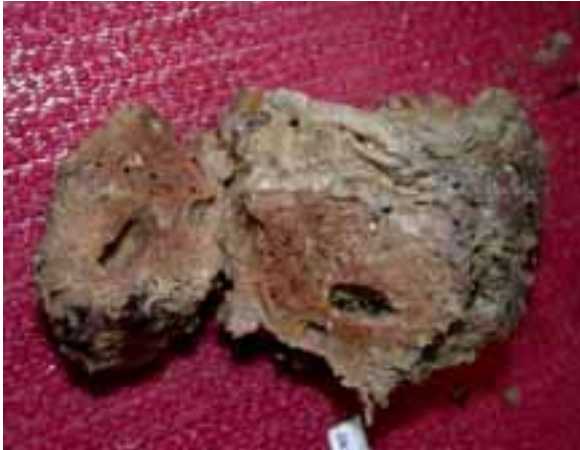
Figure 3. 26172