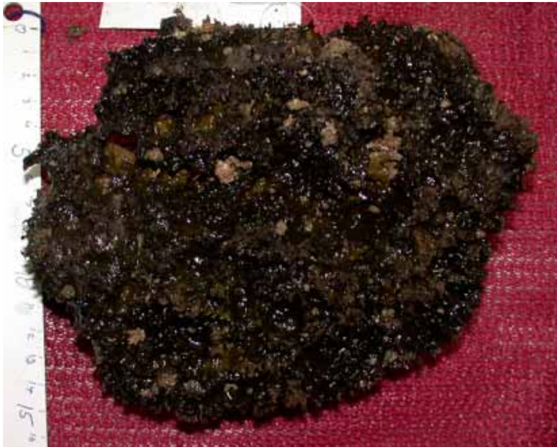
Figure 5. 26175