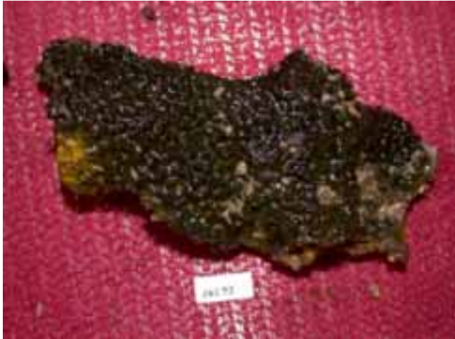
Figure 2. 26173