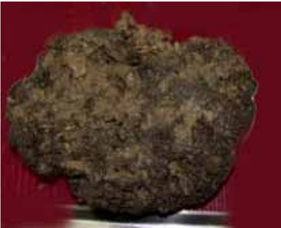
Figure 4. 26179