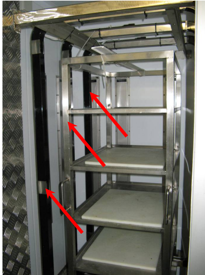
Figure 2: Interior of a fast freezing Cells Alive unit. Red arrows indicate the electro magnets that encircle the freezing trays.

Initial trials of the CAS at the Grimsby Institute have been qualitative, with no extensive validation having been undertaken. The Institute provided the author with oysters that had been CAS frozen at a variety of settings and then CAS stored. These oysters appeared to retain whiter colour and reduced drip loss in comparison to the oysters stored via a standard freezing mode. However, there was only one oyster from each treatment and the prior physical condition of original oysters was variable. The Grimsby Institute has indicated a desire to undertake joint work with the Australian Seafood CRC to validate the use of the system for oysters. Undertaking work with this Institute would allow the CRC to be co-investigators on a novel project that would be of significant scientific interest world-wide, as there is little (possibly no) published data that validates the effectiveness of this technology.