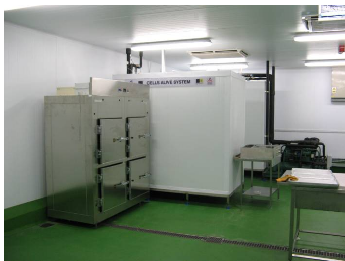
Figure 1: The Cells Alive Systems at the Grimsby Institute.

The CAS was developed in Japan by ABI Co Ltd. It utilises magnetic field generating equipment that generates a weak magnetic field in standard fast freezing equipment. This technology apparently limits the formation of ice crystal within products and maintains a product that is very close to the original fresh state of the food. Images provided by the manufacturer indicate that the system maintains the cellular structure to a higher degree than a standard freezing unit and also minimises drip loss. These units can be used either for initial freezing or for long-term storage and the degree of the magnetic field can be adjusted from 0 to 100%. The Grimsby CAS units are pictured in Figures 1 and 2.