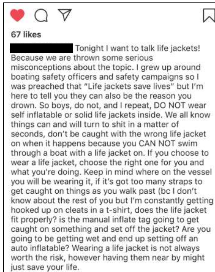
Figure 3: Fisher Instagram post on choosing to wear a PFD

What becomes evident is that for fishers, the choice of wearing a PFD is not a simple binary one; yes or no, nor is the management of any risk in the context of any individual operation based on the availability of resources, vessel layout, work environment, fishing method, years of experience etc.